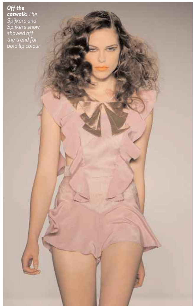
Off the catwalk: The Spijkers and Spijkers show showed off the trend for bold lip colour

A little touch of black liquid liner can give sophistication and definition to any make-up look, but for 2009 it's going to a new extreme. Forget just lining the top lashes – 2009 liquid liner looks are all about creativity and drama. On the catwalk at the Harriet's Muse show,