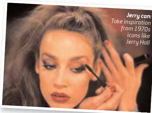
Jerry can: Take inspiration from 1970s icons like Jerry Hall

To achieve 'doll-like' lashes, try adding a touch of extra mascara to the outer corners of your lashes and then apply a few individual false lashes to the outer corners as well. Individual lashes are easier to apply – make sure you attach them just into the join of where your eyelid and natural lashes start. Shu Uemura has an incredible selection. The trick is to make sure the eyelash glue on the fake lash is left for a few