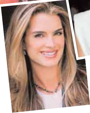
Just browsing: Take inspiration from these heavier-browed icons