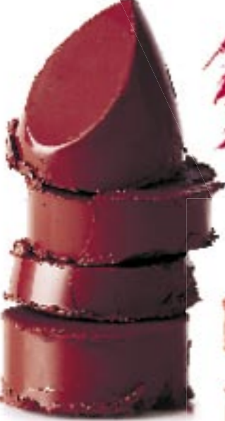
ELIZABETH ARDEN CERAMIDE PLUMP PERFECT LIPSTICK IN PERFECT BRICK, £16