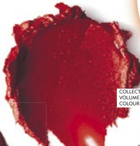
COLLECTION 2000 VOLUME BOOST LIP COLOUR IN RED RED, £2.99

'A lot of people have an uneven cupid's bow – round on one side, pointed on the other. When you line your lips, don't follow the line if it's uneven – make it symmetrical.'