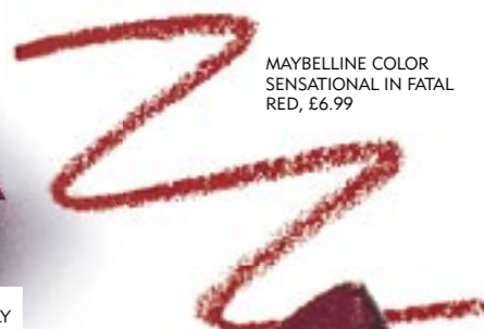
MAYBELLINE COLOR SENSATIONAL IN FATAL RED, £6.99

'Don't go by the names or you'll get in a right muddle – look at the lipstick in good light and decide yourself what colour it is.'