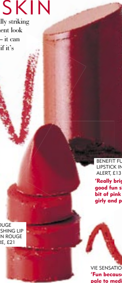
BENEFIT FULL FINISH LIPSTICK IN FLIRT ALERT, £13

'Really bright, but a good fun shade with a bit of pink to make it girly and pretty.'