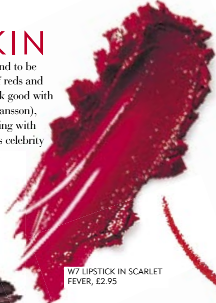
W7 LIPSTICK IN SCARLET FEVER, £2.95