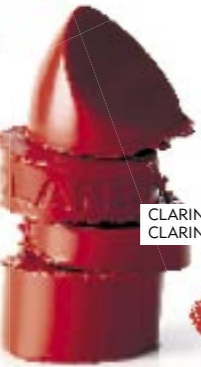
CLARINS JOLI ROUGE IN CLARINS RED, £14.50