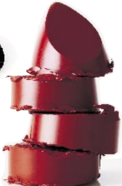
LAURA MERCIER LIP COLOUR IN TRULY RED, £17.62

'Red lips are such an eye-catching statement, they're almost an accessory in themselves, so you'll need to plan your outfit to match your lipstick.'