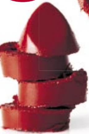
ESTÉE LAUDER PURE COLOR LONG LASTING LIPSTICK IN CLASSIC RED, £16 'A beautiful pillar-box, classic red, just like the name suggests. This would really stand out on Asian skin.'