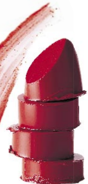
TOO FACED LIPSTICK IN RUNWAY RED, £12

'Red lippy brings out all the yellowness in your teeth, and the redness in any blemishes, so get busy with concealer, foundation and whitening toothpaste.'