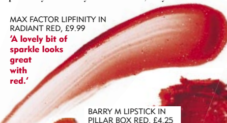
BARRY M LIPSTICK IN PILLAR BOX RED, £4.25

'A lovely bit of sparkle looks great with red.'