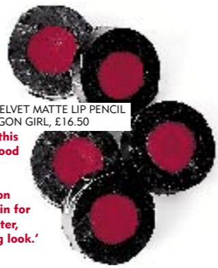
NARS VELVET MATTE LIP PENCIL IN DRAGON GIRL, £16.50

'I love this Hollywood starlet shade. Great on pale skin for a brighter, evening look.'